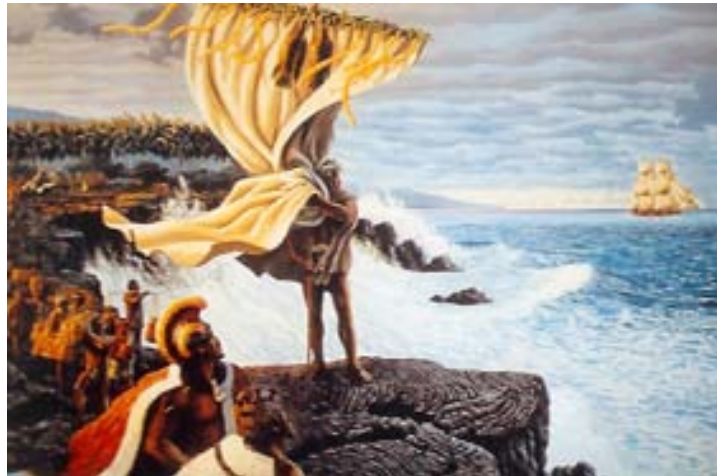
Figure 2 69

Furthermore, the current circulating myth includes the belief that Lono would be fair skinned and bearded. Although this portion of the Hawaiian myth has not yet been discredited by historians, most likely, similarly to the case of Quetzalcoatl, it was added after European contact. By depicting the Hawaiians as anticipating a white, bearded god, the missionaries would be able to argue that the natives wanted to be saved from their