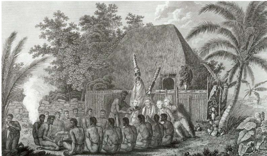
Figure 1 30

Another valuable resource historians use to study the ancient Hawaiian beliefs are the documents produced by missionaries. Since the Hawaiians had no written language, these records have become essential in understanding the initial contact period.