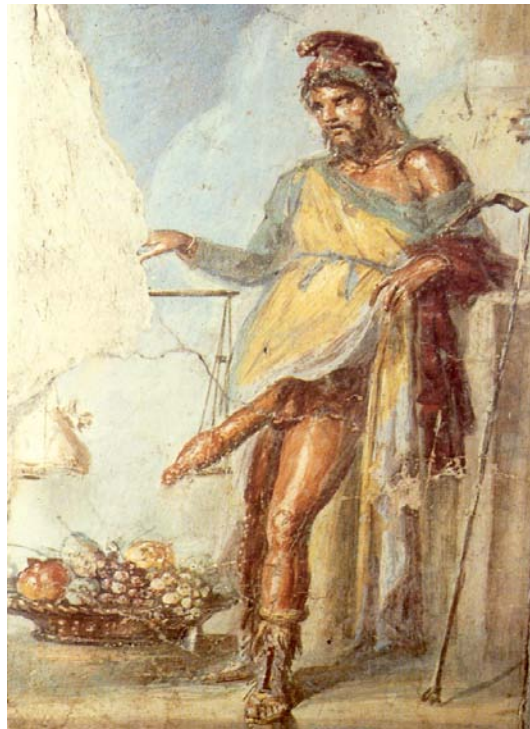
Figure 5: Fresco in the entrance of the House of the Vettie of Priapus (Varone, 25)

dreams and rape you with his large phallus) weighing his large phallus (penis) on a scale, that is being weighed against a large sack of money.