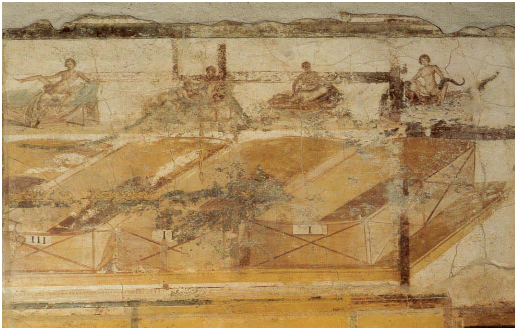
Figure 3: Wall decoration at Suburban bathhouses of erotic scenes with numbered boxes underneath them (Varone, 30)

Obviously when people visited the bathhouses they needed to put their clothes in some kind of container, which would be similar to our lockers. In the suburban bathhouses in Pompeii we see erotic depictions being used as a way for illiterate people to know in what container they left there clothes.