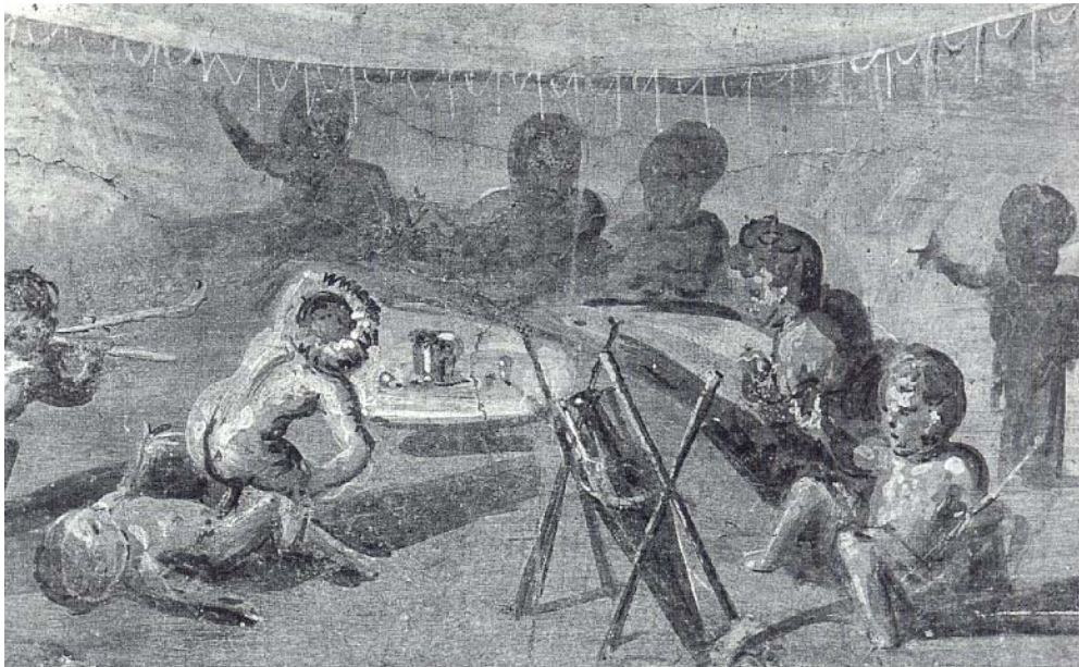
Figure 1: Pygmy erotic scene from House of the Physician (Clarke, 44)

The ancient Roman City of Pompeii is a spectacle of some of the worlds most beautiful and risqué forms of artwork ever found from ancient ruins. It is a city of beautiful villas, streets, bakeries, mansions, coliseums, bars and brothels. But the artwork of Pompeii is not like others found around the world. Rather the artwork from the city of Pompeii is very erotic. The city of Pompeii holds many secrets regarding the ideas of Roman morality, the erotic frescoes that line entire rooms with depictions of orgies, fellatio and cunnilingus sexual positions, and many other erotic depictions. Depictions in Peristyle Gardens (a colonnaded courtyard) show beautiful frescoes of Pygmies at a banquet being entertained by male and female pygmies having sex in front of the rest of the banquet. What does this depiction mean?