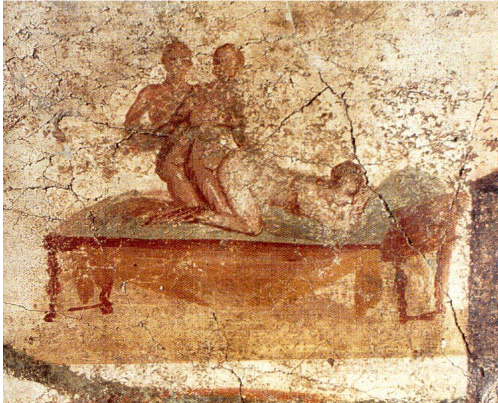
Figure 2: Threesome of two men and 1 woman from Suburban Bathhouses (Clarke, Plate 14)

This picture shows the erotic idea of threesomes. But what is most interesting of this painting is the particular position that is being used. The first person, a female, is laying head forward with her back to the air. The second person we see in the chain is the first male, who has inserted his penis into the women. But while the second man is penetrating the women the third man is penetrating the second man with his penis. This seductive train that we see from the suburban bathhouses once again raises many interesting questions. Where the depictions in the bathhouses used to aid or start such live shows? Depictions such as this one from the apodyterium 7, scene VI from the Clarke text, are not uncommon. Several other depictions from other bathhouses also show men and women couples, women on women, and also men on men coupling as well.