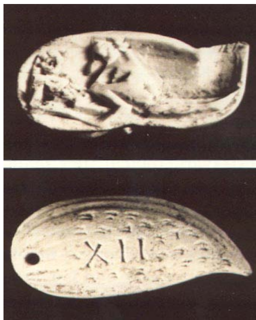
Figure 4: Erotic token to boxes at Suburban bathhouses, made of bone and on one side showing two people in the act of love with a woman astride a man and back side the numerical number of a box being used (Varone, 37)

On the south wall of the Suburban bathhouses, we can see containers in the changing room with numerical numbers on them and directly above the container an erotic depiction of some kind. What is further amazing is that there has been found in both the bathhouses and in other parts of the city are bronze and lead tokens that bare the same erotic depictions scene above the containers in the changing room. Also on the flip side of the coin it has a numerical number ranging from I to XVI, which corresponds with the numerical numbers of the containers as well from I to XVI. This coincidence allows us to draw the conclusion that these tokens may have been used to help illiterate people remember where they may have left their clothes after using the bath. This would allow the bather to either use the erotic depiction or the numerical number, what ever fit his liking. “What counts, however, is that , apart from the functional use of such tokens in