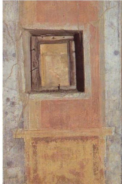
Figures 8 and 9: Picture of opening for tabulae pictae for erotic depictions (Varone, 66)

It seems very logical that a slave could have been on the other side of the wall, and while the master and his guest were partaking in sexual intercourse the slave could load an erotic fresco into the insert in the wall, and open the doors to suggest a new position. "...the owner of the house had bought pictures and had them inserted into the existing decoration directly on the wall. This phenomenon has been found elsewhere in Pompeii in important houses, such as in the House of Menander... These were made on perishable material that has not survived. Such pictures, which the context leaves no the slightest doubt were of erotic content... Covered until the door was opened, the picture was revealed to suggest a particular sexual position. The possibility that the picture could easily be replaced from the adjacent room, perhaps by a slave meant that each time the