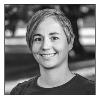
2022 Pastega Faculty Award for Excellence in Service

"We have students focused on acorns, tree physiology, birds, amphibians, reptiles and insects, all working together in a cross-disciplinary way with the overarching theme of how we conserve ecosystems and the organisms that live in them."