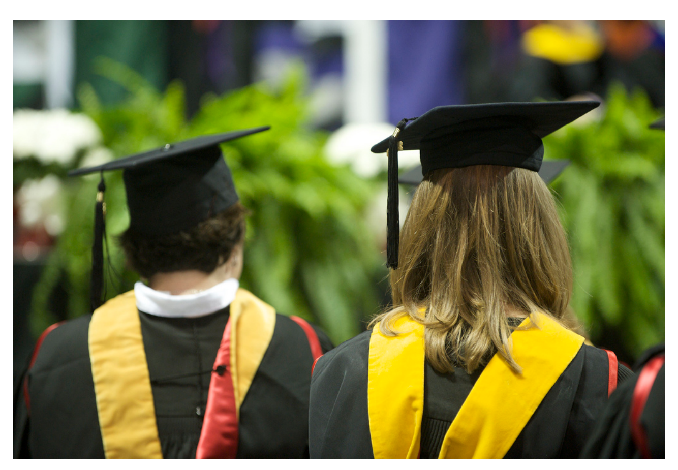
A GUIDE FOR SUCCESS IN SECONDARY AND POSTSECONDARY SETTINGS U.S. Department of Education October 20, 2015